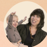
Alison GOPNIK Distinguished Professor, Department of Psychology, University of California, Berkeley