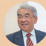
KANADE Takeo U.A. and Helen Whitaker Professor, Robotics Institute, Carnegie Mellon University